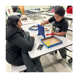
Family Game Night