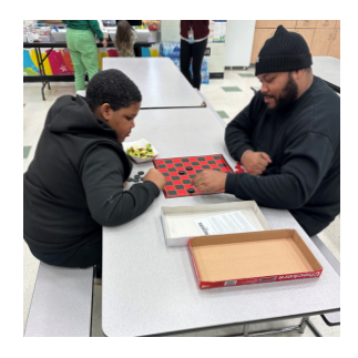
Family Game Night