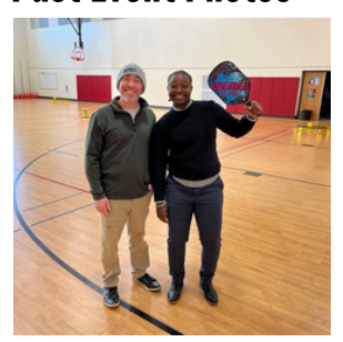
Pickleball Paddle Donation