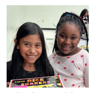
Family Game Night