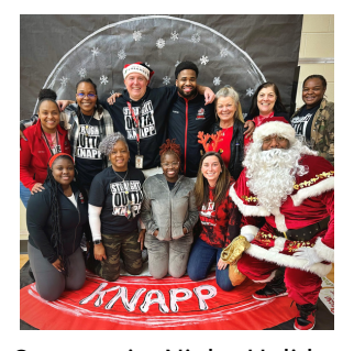
Community Night: Holiday Celebration