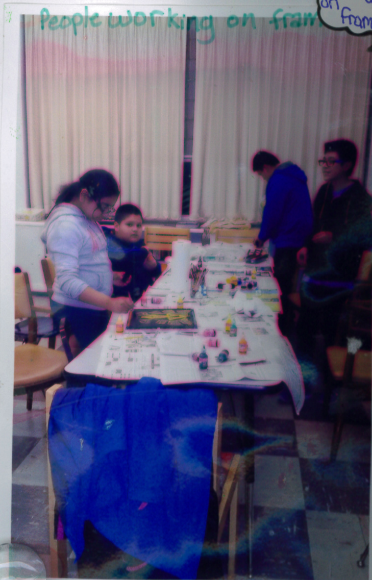
People working on frames

4. We helped the Women's Resource Center by making their art therapy program become more mobile with the art cart. It helped us to know that every once in awhile it feels good to do something special for the community.